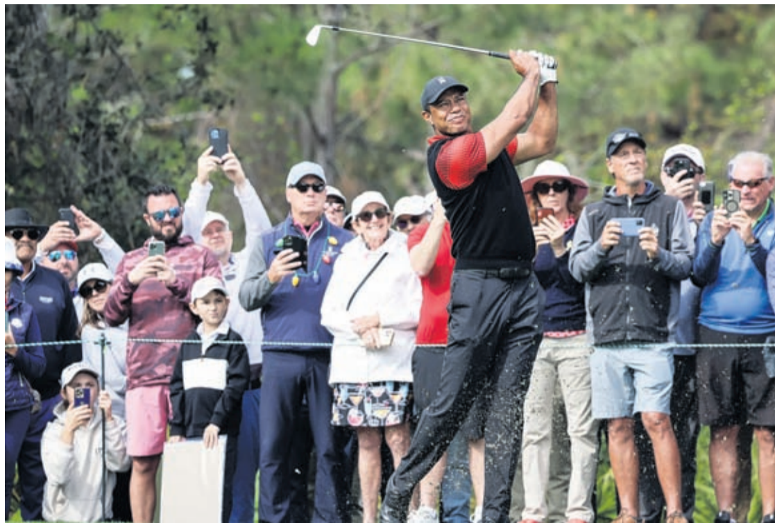
Tiger Woods tees off on the 4th hole during the final round of the PNC Championship golf tournament Sunday, Dec. 18, 2022, in Orlando, Fla.

Small victories? Not really. Woods said in the Bahamas earlier this month, when he